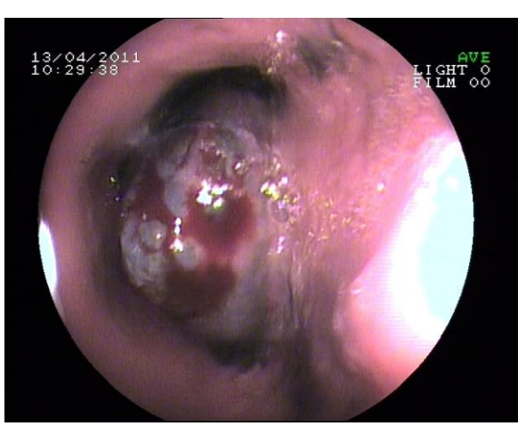
Figure 1: Endoscopic shows pigmented polypoidal lesion in esophagus.

Investigations: Complete hemogram and blood biochemistry reports were within normal limits. Chest radiograph was normal. Upper GI scopy showed pigmented, vascular polypoidal growth at 25 cm and 35 cm from incisor (Fig 1).